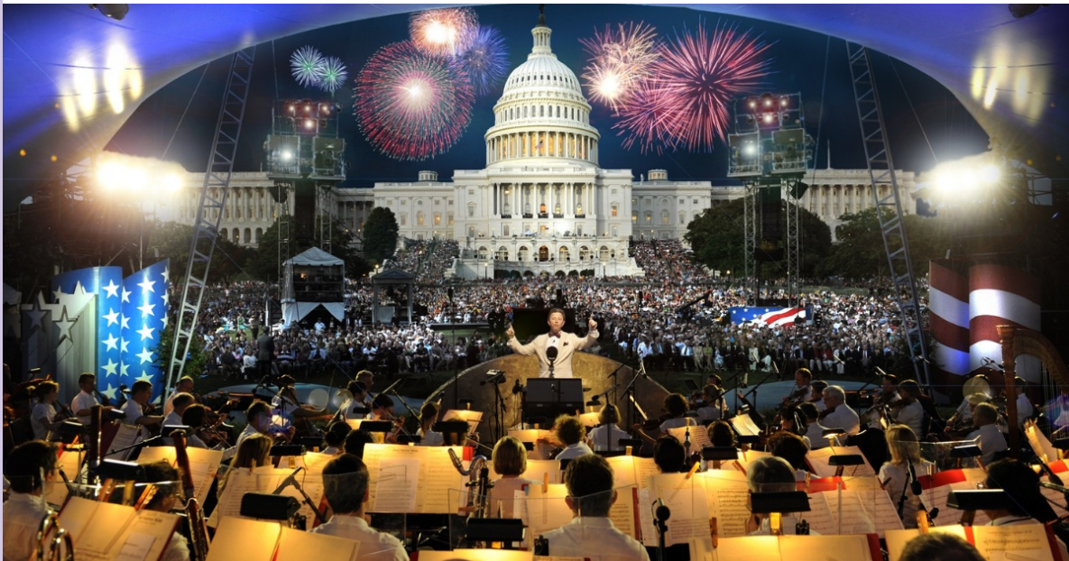
A Capitol Fourth Tuesday, July 4 at 8 p.m.