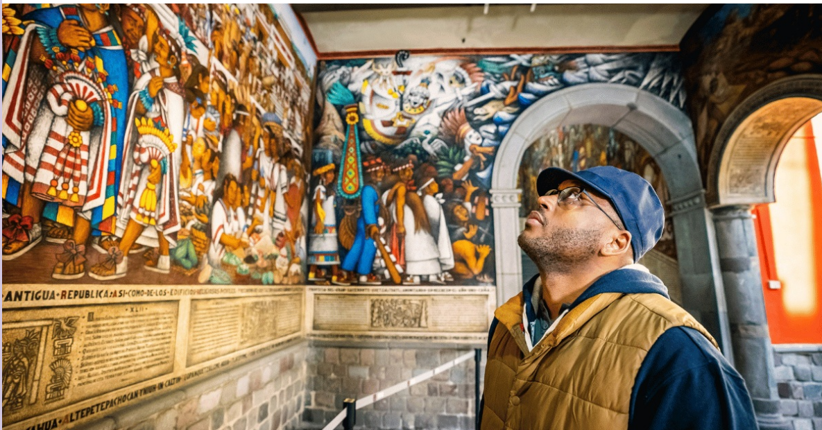
Human Footprint Wednesdays, starting July 5 at 9 p.m.