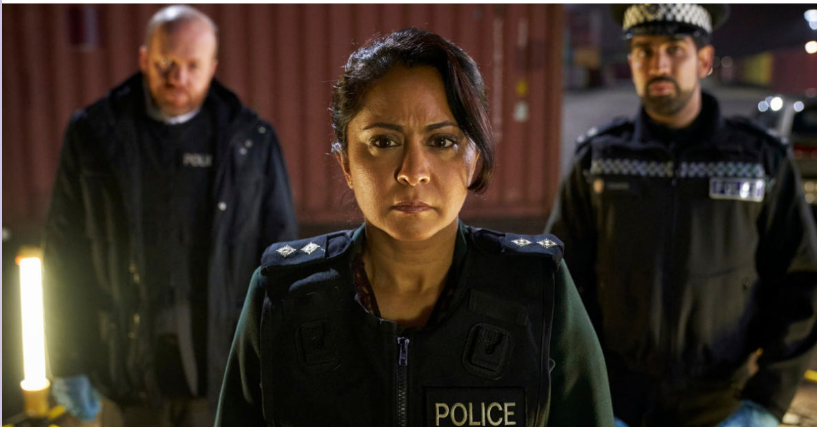
D. I. Ray Sundays, starting July 9 at 10 p.m.