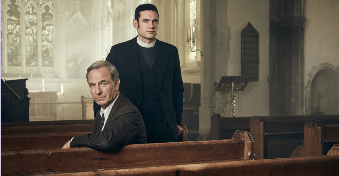
Masterpiece: Grantchester Sundays, starting July 9 at 9 p.m.